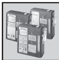
Universal Sample Pumps

SKC Inc. Eighty Four PA USA Tel: 724-941-9701 Fax: 724-941-1369 www.skcinc.com