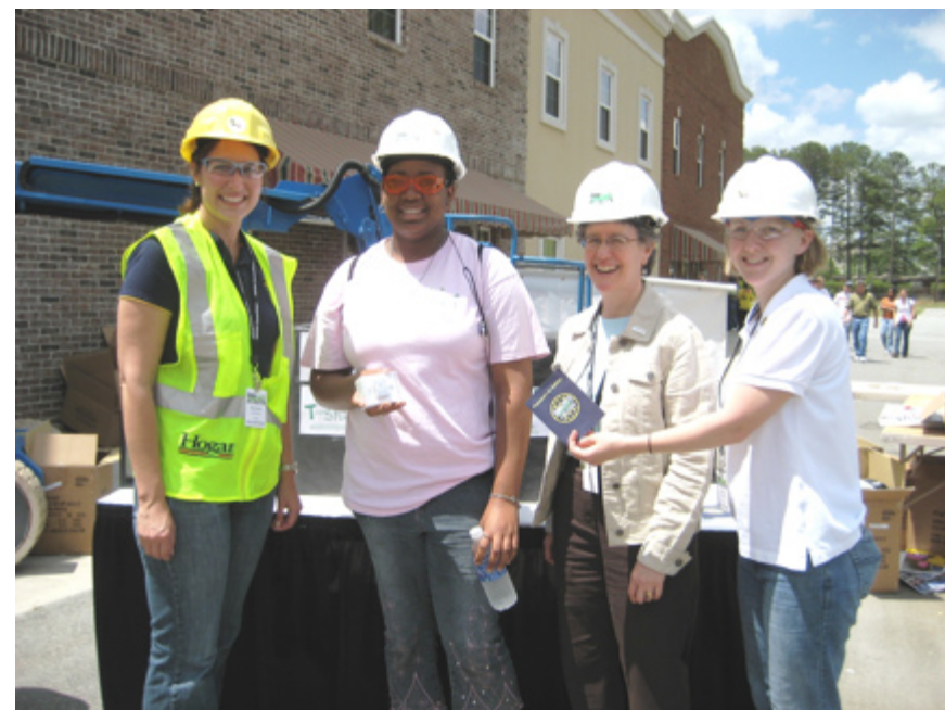
GLS at CEFGA:

For more information about the Expo, SkillsUSA, or CEFGA, please call 678-889-4445 or visit www.cefga.org.