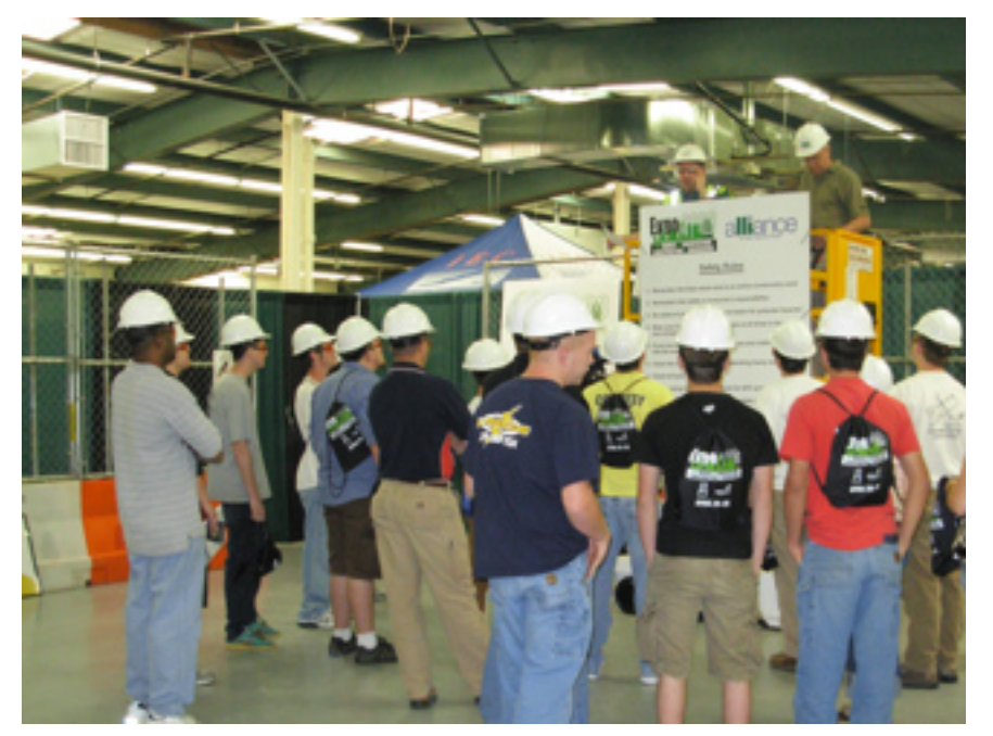
Figure 1. Safety briefing in the World of Safety.

Our goal is to help promote AIHA's core message of protecting worker health and to help increase students' awareness of workplace safety and health concerns. This event provided the platform to get them off to a good start. Each student received a "Passport to Safety," and to get the passport stamped in each of the "worlds," each student had to complete a safety exercise related to the industry represented by each world.